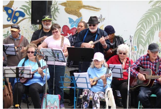
Photo 7: Sun City Ukulele and Guitar Music Group at Te Haeata Gala 2016

Whanaungatanga Community Engagement Joint Ventures